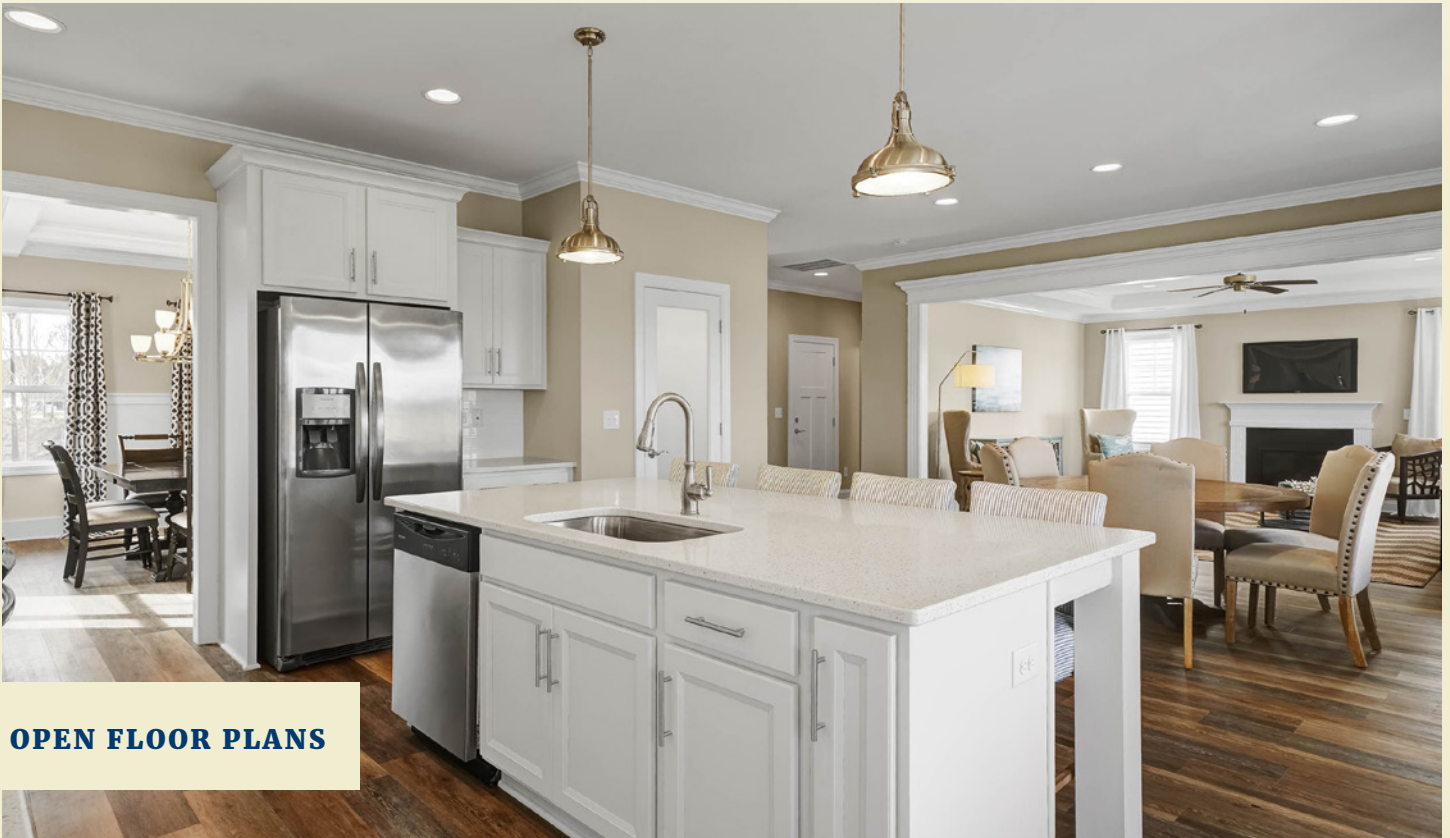
OPEN FLOOR PLANS